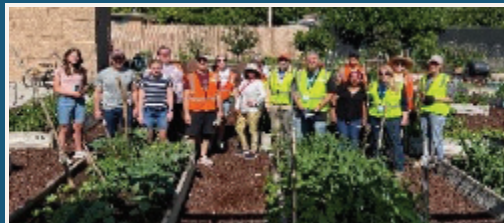
Volunteers working on the Glendale Community Garden.