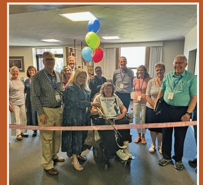
Westside Community Help Center ribbon cutting, "Free and Open to All!"