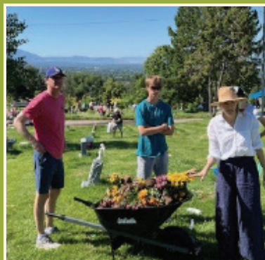
Salt Lake City Cemetery cleanup following Memorial Day.