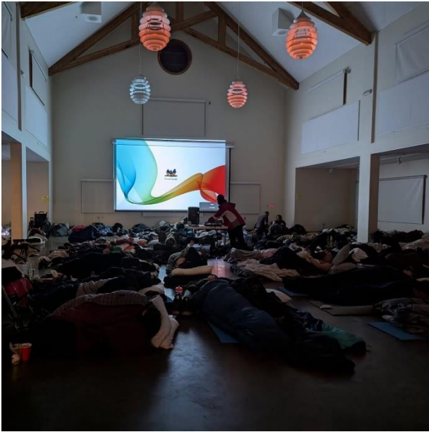
St. Mark's Episcopal Church