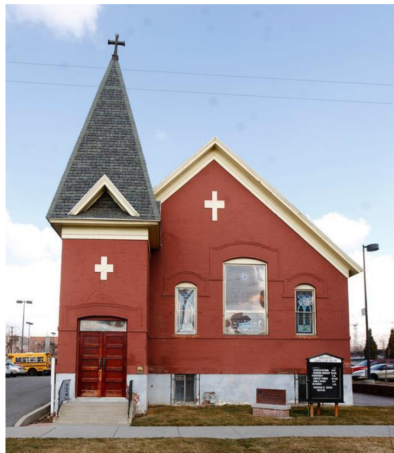
Trinity Church room renovation 3-5-25